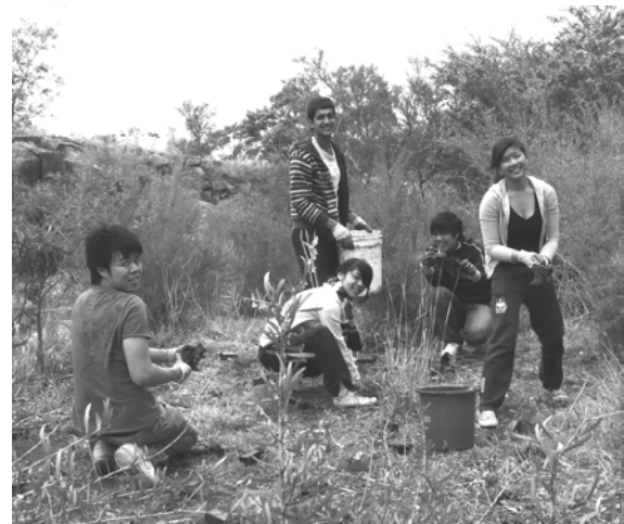
Photo: Planting by Melbourne Uni and RMIT students as a leadership skills building exercise in September - one of the dozens of activities MCMC has helped organise over the years that have protected biodiversity and prepared Galada Tamboore as a visitor destination.

For upcoming community events see the MCMC website: www.mcmc.org.au