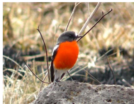
Flame Robin; a winter visitor to the Merri Grasslands

MCMC's Parkland Management Team was extremely busy restoring threatened vegetation along the Merri, Edgars and Aitken Creeks from Clifton Hill to north of Beveridge during 2009. With two grants totalling $181,236 from the Federal Government's Caring for our Country program the on-ground works team expanded to 15 staff. Over 400 community members worked with our team in the implementation of vegetation restoration works at 16 important grassland, escarpment and riparian sites. Habitat quality assessments were made at 10 of these sites. These assessments were used to shape management recommendations that will enhance ongoing restoration efforts for the endangered vegetation at these sites.