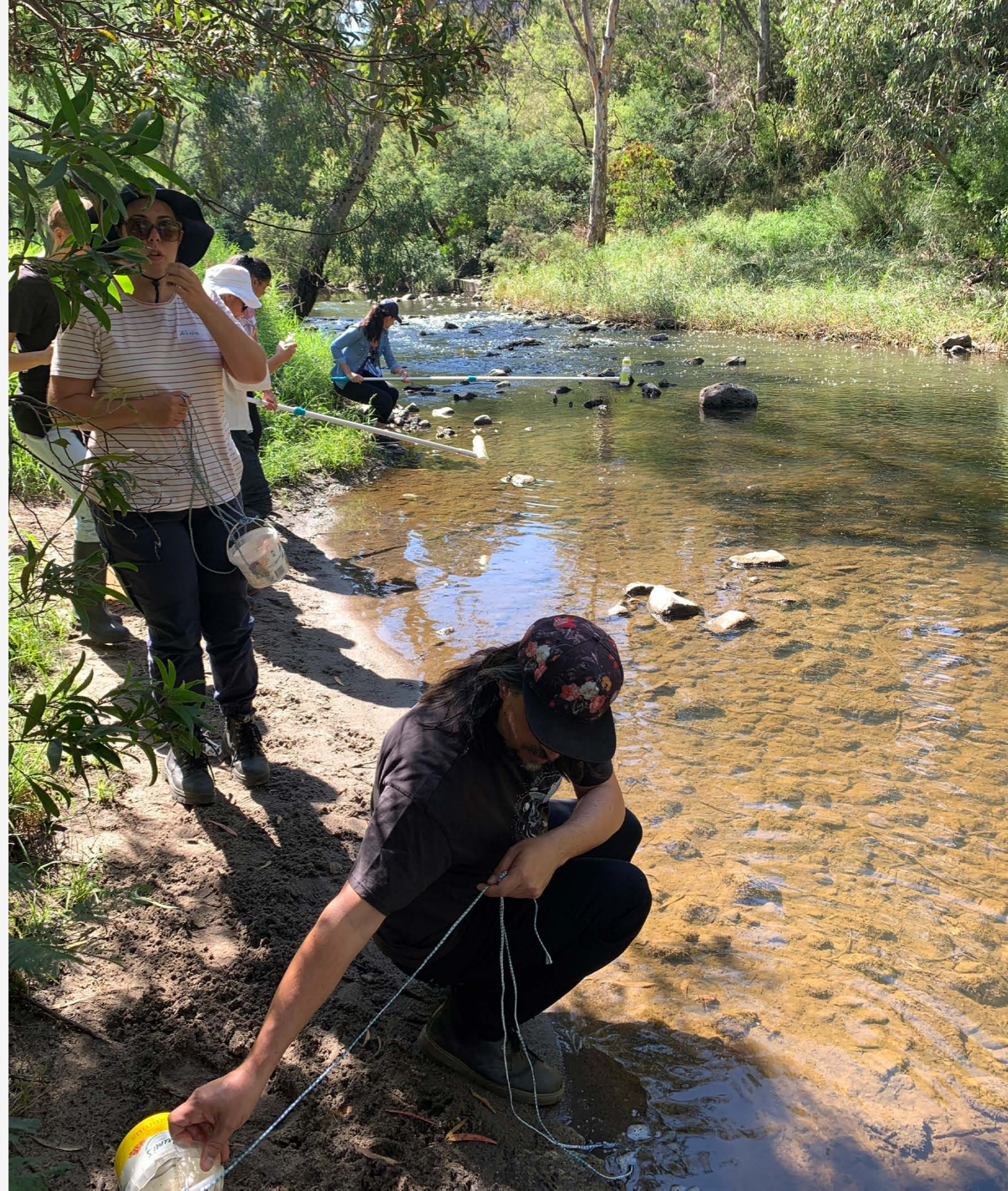
↑ Volunteers collect water samples as part of the MCMC supported WaterWatch program.

Our member organisations, the community, stakeholders, partners, and clients continue to support and value our ongoing efforts and leadership. Our vision and purpose remain relevant.