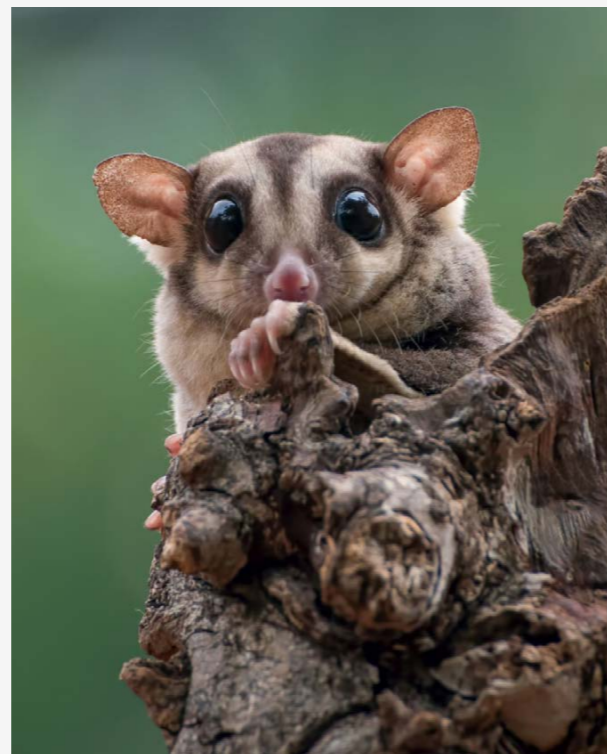
↑ Krefft's Glider.

Most of the upper reaches of the catchment are currently rural but rapidly urbanising. In the middle and lower reaches, the catchment is predominantly industrial and residential. Over the past 45 years the conservation value of Merri Merri Country has been enhanced by the repair and restoration work of MCMC, First Nations people, the Friends of Merri Creek, Wallan Environment Group, and other local groups, and local and state governments.