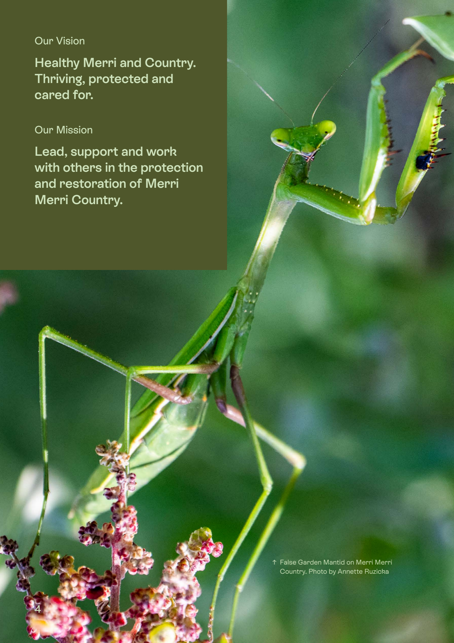
↑ False Garden Mantid on Merri Merri Country.

Lead, support and work with others in the protection and restoration of Merri Merri Country.