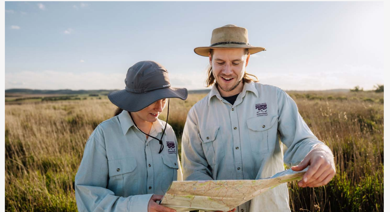
↑ MCMC staff at Green Hill in Wallan, Wurundjeri Country.