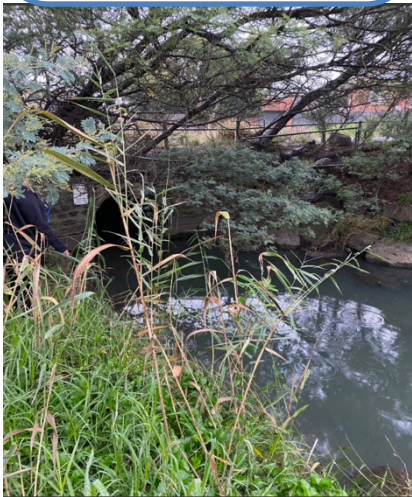
Site photo taken on 09/06/2024

pH levels remained consistent from May to December, generally around pH 7, with the highest pH observed in September at 8.26, which exceeds the quality indicator values. Overall, pH levels are well within range of the EQI.